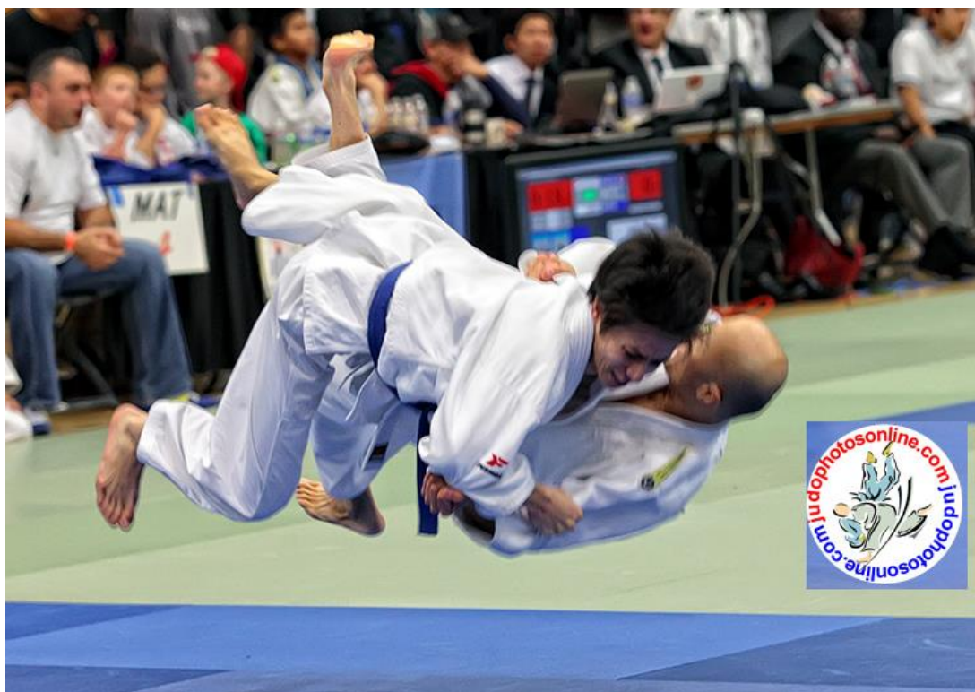
Gary Wagstaff Action Photos